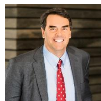
Tim Draper Founder Draper Associates