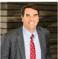
Tim Draper Founder Draper Associates